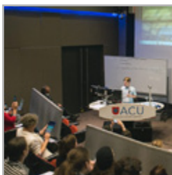
Primary students presenting at the 2016 Kids' Conference